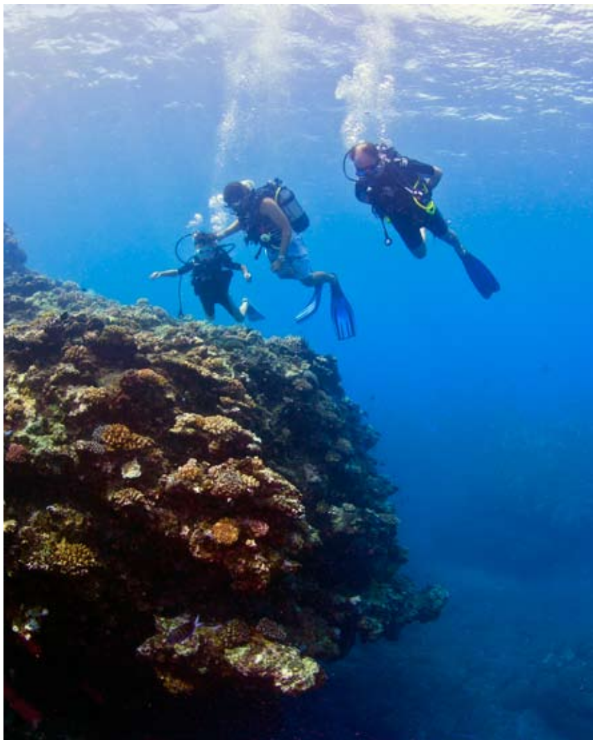
Pain de Sucre