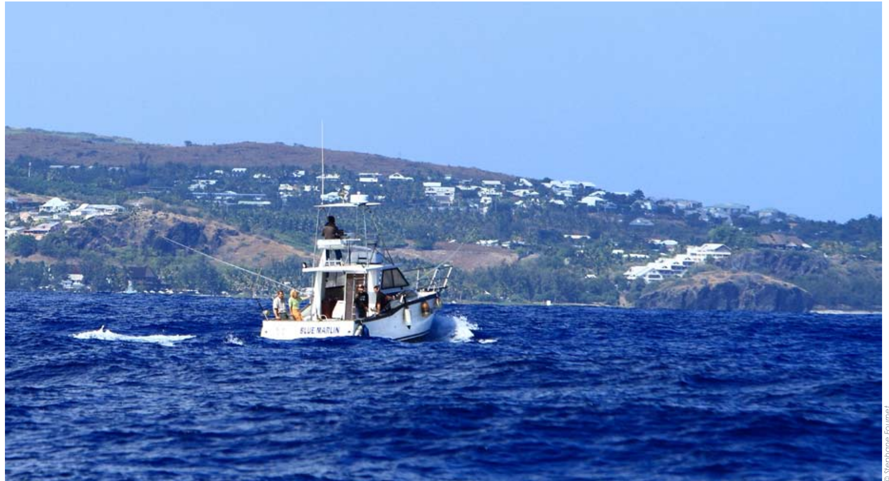
Pêche Au Gros

Practical information: https://en.reunion.fr/our-experiences/sunset-cruise-after-beach