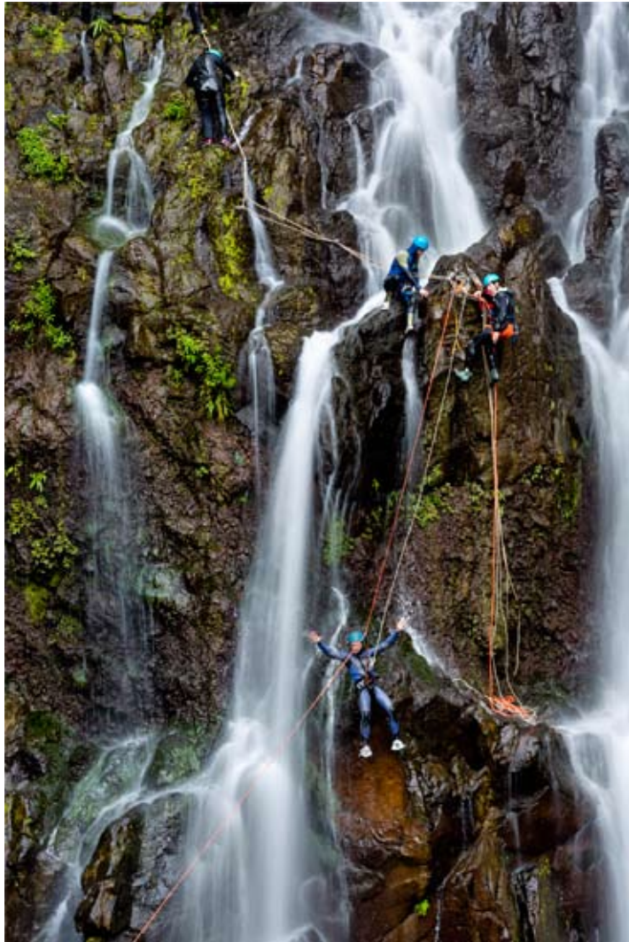
Waterfall Grand Galet