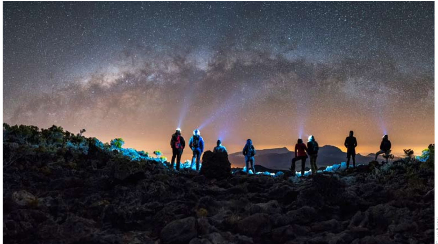
Milky Way sighting at the Plaine des Cafres