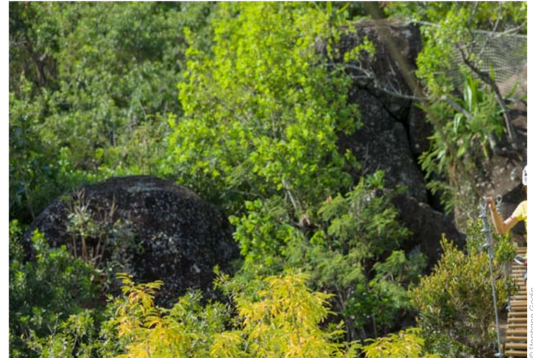
Accrobranching Acroroc Saint Pierre

Practical information: https://en.reunion.fr/our-experiences/walk-along-a-river