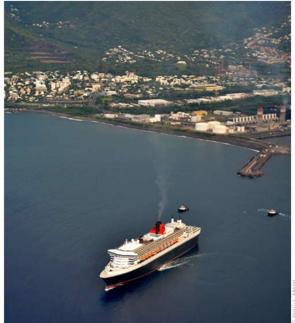
Cruise Boat Port Est Queen Mary